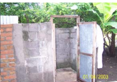
The shower place