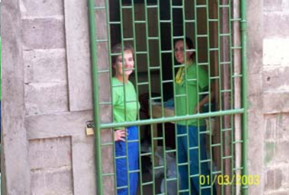
The drug store