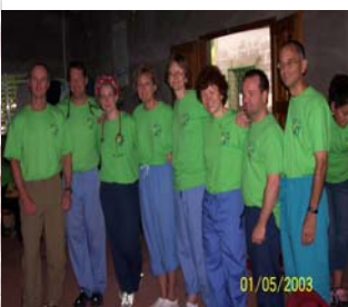
Doctors & translators