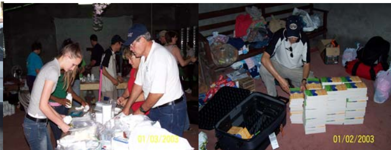
Organizing the medical supplies & Bibles