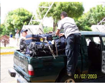
Loading the trucks