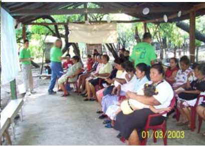
A 20 minute class before Medical attention