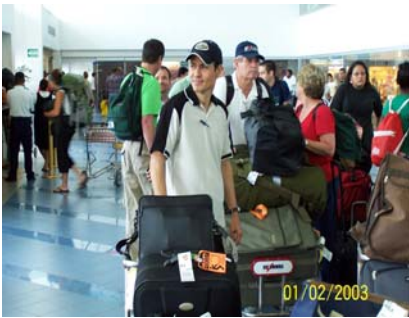
Arriving at the Managua airport

The church from San Jose Church of Christ in Jacksonville, Florida was conducting a medical and evangelistic campaign in city of Momotombo, Nicaragua. This city doesn't have pavement roads. They have bad water which is one of the reasons for the amount of kidney diseases that there are and worms as well as other complaints they manifested during our medical campaign. We were able to witness over 1,000 people who received medical attention in less than three days. 11 people were added to the body of Christ. Around 350 people came to watch the movie "Jesus" in Spanish. We fed families that came to our meetings with one pound of rice and beans. We gave cookies, notebooks, pencils, toys, and clothes to about 150 children. I have never seen so many children coming together for a movie presentation. And I will never forget their smile as they received their gifts. About 34 Bibles were given away during our meeting. After all, as we saw so much misery we could feel that what we did for them wasn't enough, but the most important thing is that the Gospel of Christ was preached to as many as we could and God was glorified among them. Hope the pictures below will give you an idea of what we experienced there. God is so good.