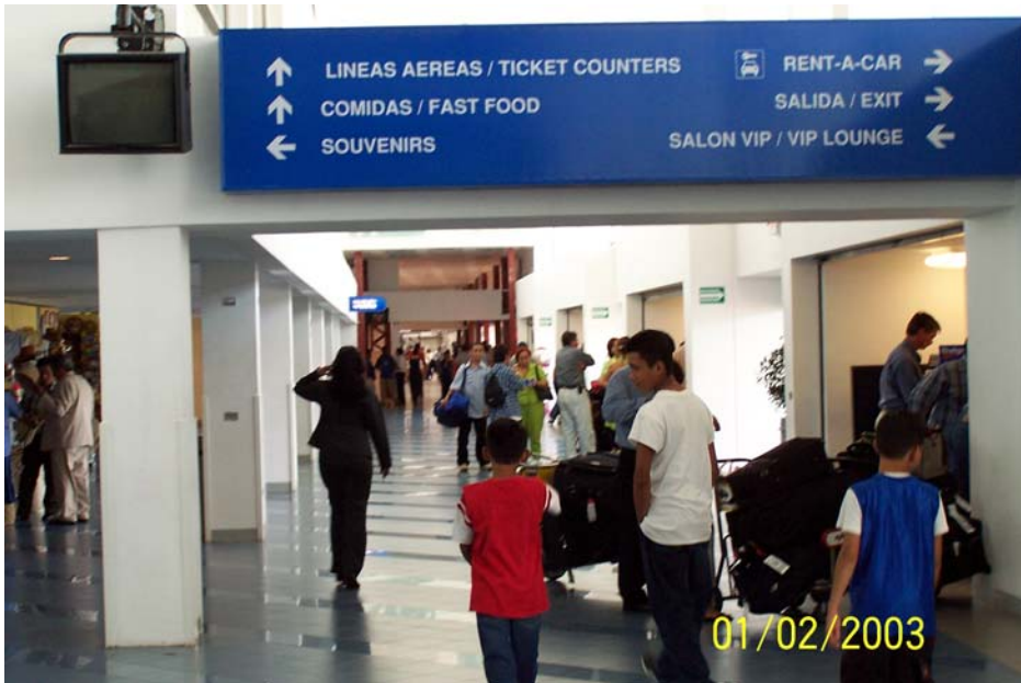
Time to go