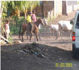
Very country roads