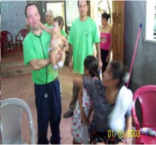
One of our Doctors