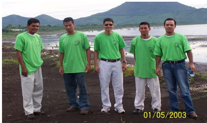
Behind is the Momotombo Volcano which destroyed the city some years ago.