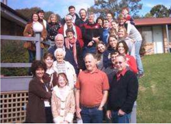
Gathering at Meroo Christian Centre